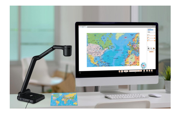
Use IQView Micro-Lecture Making software through the connection of USB port to PC.