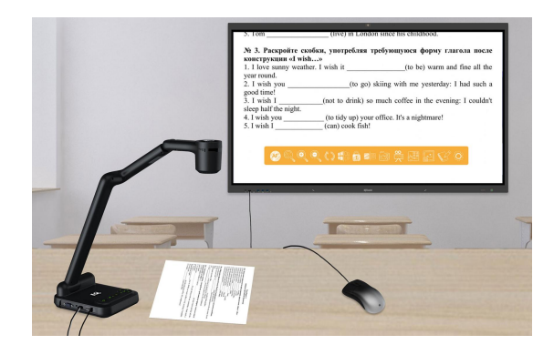
Connect HDMI Out to the display, and the mouse to USB port for built-in whiteboard software access.

E4521 visualizer provides multiple ways to access the powerful interactive whiteboard software for your education enhancement.